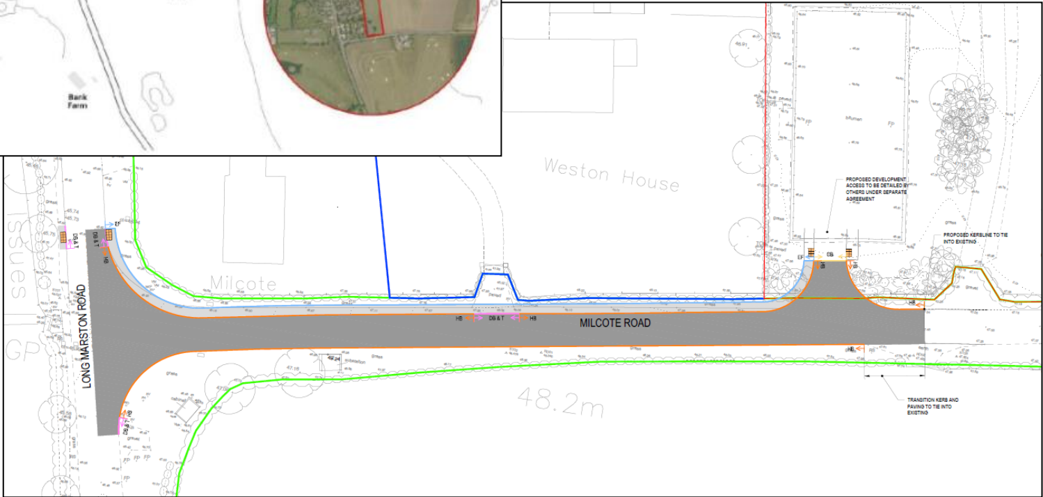
S278 scheme: C104 Milcote Road, Welford on Avon